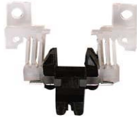
Andis Blade Drive

Worn Blade Drives/Levers will affect the movement of the Upper Cutter Blade against the Lower Comb Blade