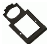
Hinge Latch or Lock

The performance of the Blade may be questioned when the Clipper may be at fault. If your Clipper has a push-up Blade release, check to see if the latch or lock has a bent down clip on it to secure the blade. The curled or bent portion of the latch or lock can break off causing your blade to drift away from the Clipper and not be fully engaged with the hinge.